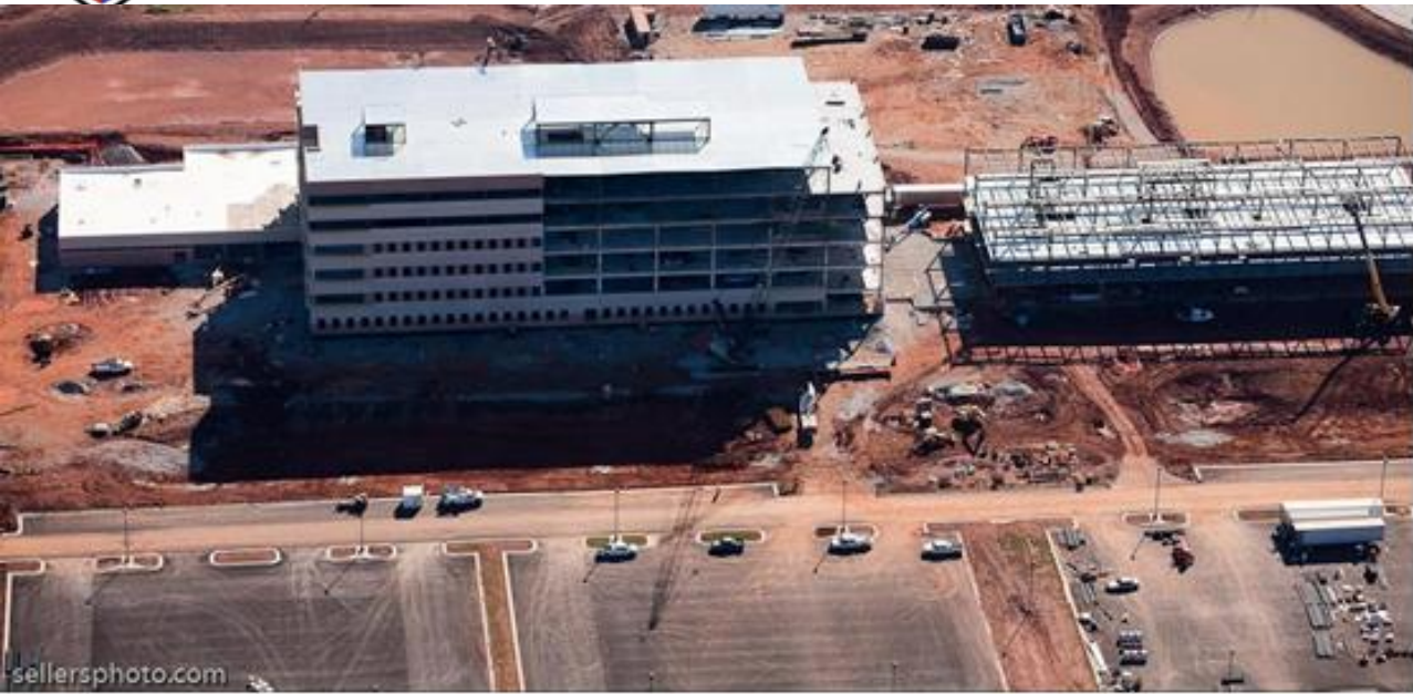
AMC /USASAC facility as of Nov. 2009