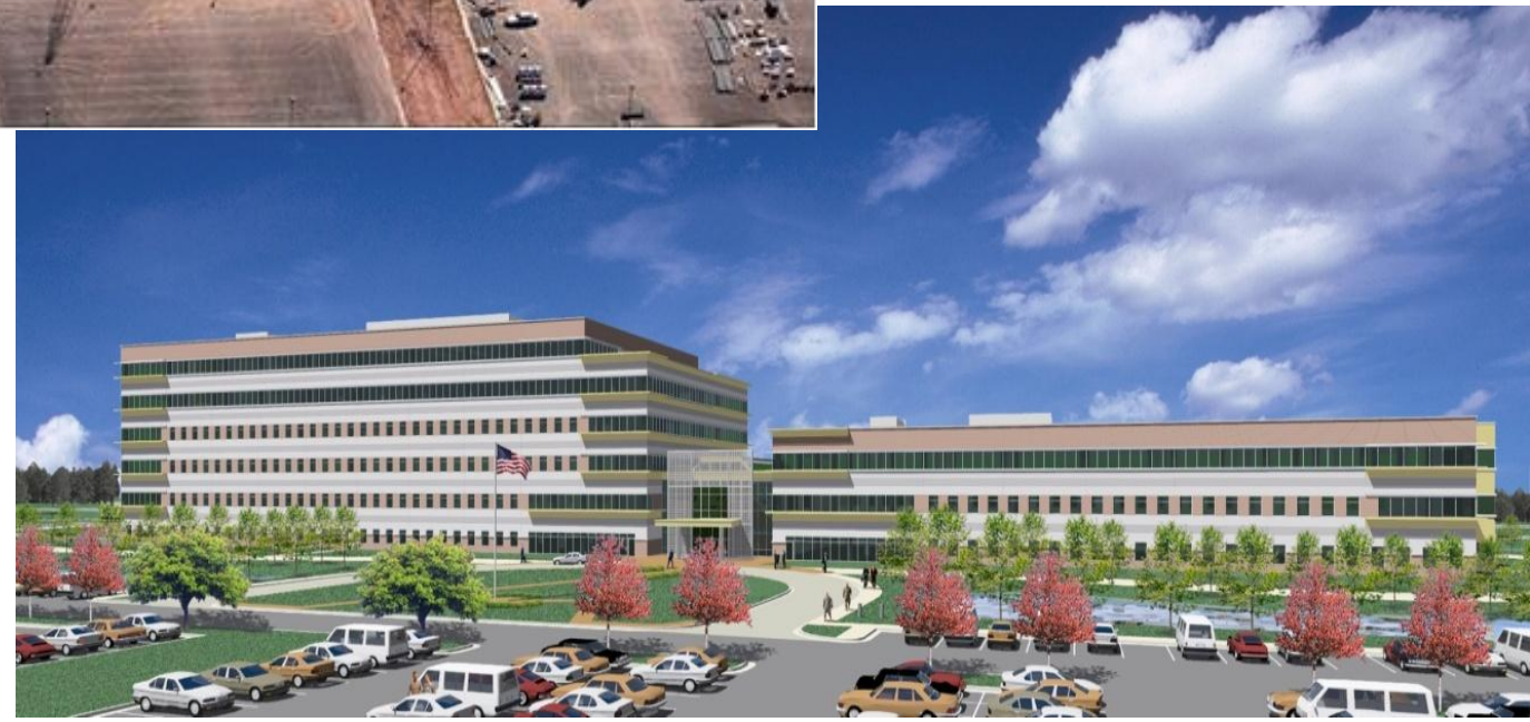
Artist rendering of completed facility