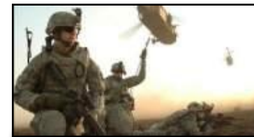
Forward Support (FRAs and ESAs)