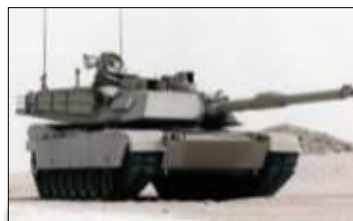
Foreign Military Sales