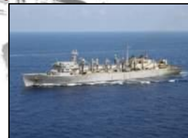
Army Pre-Positioned Stocks (APS)