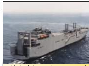
Global Distribution and Deployment